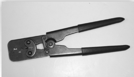
Double crimp tool. Used for larger gauge terminals and double wire crimps. p/n 500523 .....$89.95