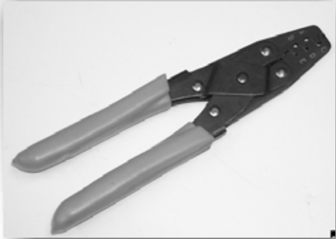
Single wire crimp tool. Used for smaller gauge terminals. p/n 500518 .....$45

American Autowire has high quality crimp tools for your project !