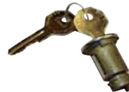
AAW P/N 500674 (smooth face):

NOTE: AAW has new lock cylinders with the correct GM style keys for your new 500684 ignition switch. Check below for your vehicle's correct application.