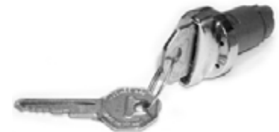
AAW P/N 500672 (with finger guard):