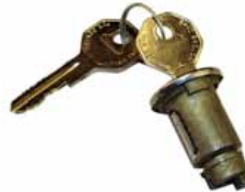
AAW P/N 500674 (smooth face):

NOTE: AAW has new lock cylinders with the correct GM style keys for your new 500684 ignition switch. Check below for your vehicle's correct application.