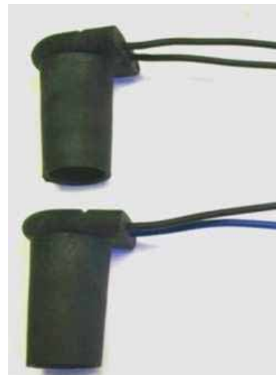
Parking Lamp Pigtails

(plug onto dash harness 500662 "Bag G" sheet #3 item #13.)