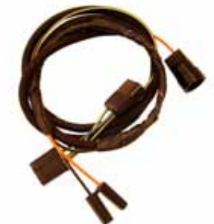
Turbo 400 Kickdown Harness