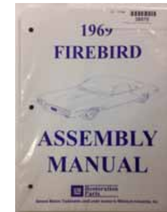
1969 Firebird Assembly Manual