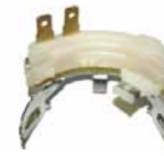
Back-up Light Switch for Manual Trans